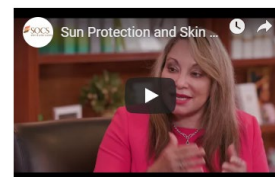
Sun Protection and Skin Cancer Prevention in Melanin-Rich Skin